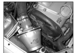
Apollo without end cap / cold air hose fitted