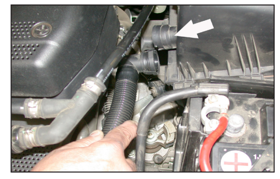
7. Disconnect the air pump vent hose as shown.