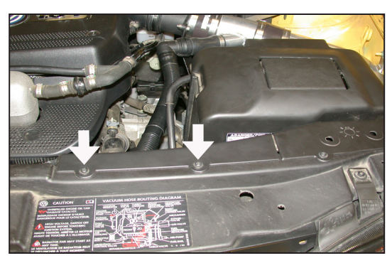
49. Reinstall the inner core support cover as shown.