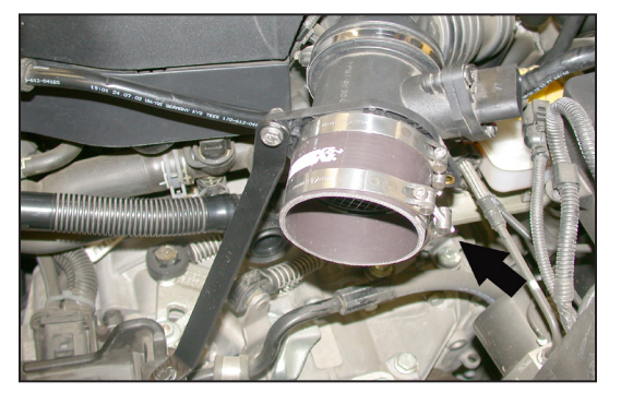
30. Install the silicone hose and hose clamps onto the mass air sensor but do not tighten at this time.

29. Secure the provided bracket to the mass air sensor using the provided hardware, then secure the other end to the battery tray using the stock air cleaner bolt as shown.