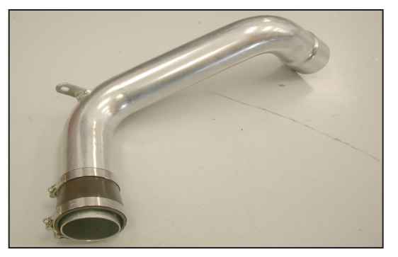
36. Install the silicone hose and hose clamps onto the K&N ^{\odot} cold air tube as shown.

NOTE: Vehicles that are not equipped with Air Injection; use the supplied plug (08246) to cap the tube vent.