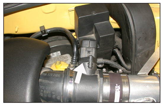
50. Reconnect the mass air sensor electrical connection as shown.