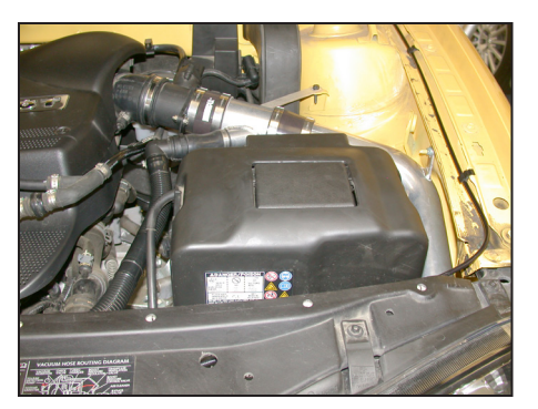
46. Reinstall the battery cover as shown.