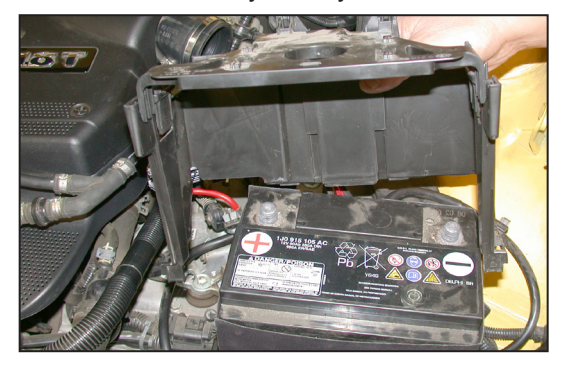
18. Remove the battery cover as shown.