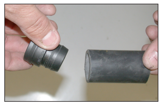
33. Install the provided plastic fitting onto the silicone hose from step 32.

32. Cut a 2-1/2" length of hose from the provided silicone hose as shown.