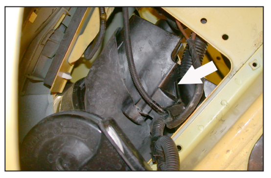
23. From underneath the vehicle remove the lower plastic rivet from the inner plastic headlight cover as shown.