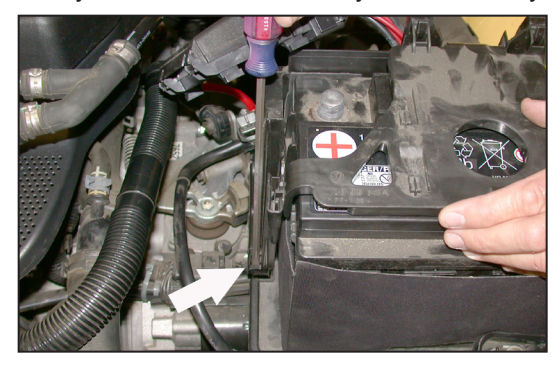
17. Depress the two lower release tabs on each side of the secondary battery cover as shown.