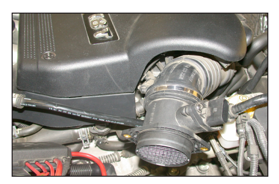
28. Reinstall the mass air sensor into the stock rubber intake hose as shown, but do not tighten at this time.