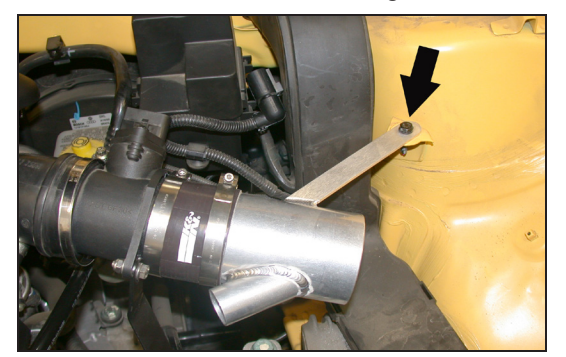
31. Slide the short K&N<sup>®</sup> intake tube into the silicone hose and secure the tube bracket to the original air cleaner mounting hole using one of the air cleaner bolts removed earlier.