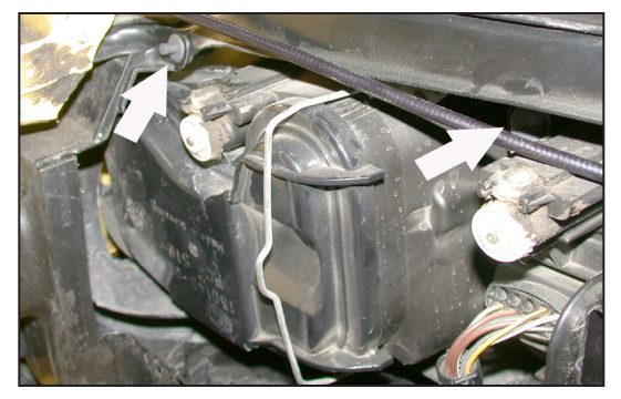
22. Remove the two upper plastic rivets from the inner plastic headlight cover as shown.