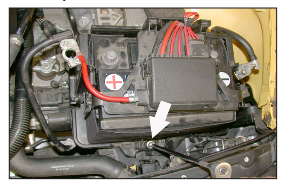
14. Remove the battery hold down block as shown.