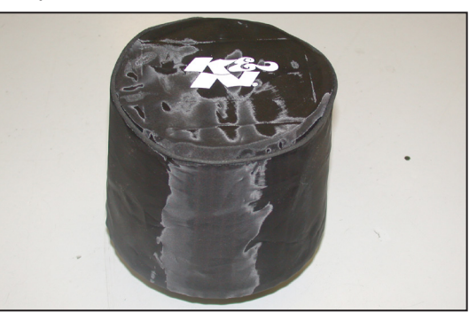
39. Install the K&N<sup>®</sup> Drycharger<sup>®</sup> onto the K&N<sup>®</sup> air filter as shown.

38. Slide the hose over the short ram tube, adjust for best fit and clearance and tighten all hose clamps and hardware as shown.