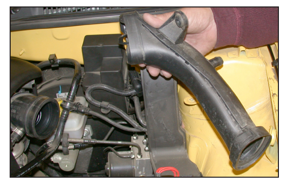
11. Remove the nut that secures the air inlet duct, then remove the air inlet duct as shown. NOTE: K&N Engineering, Inc., recommends that customers do not discard factory air intake.