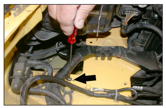
26. Using the provided plastic clamp secure the harness to the inner fender using the provided hardware as shown.