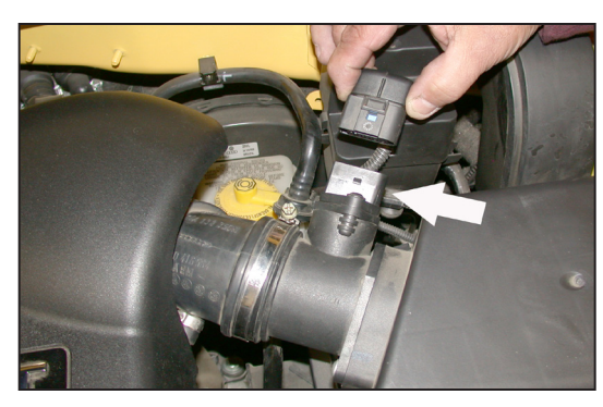
4. Disconnect the mass air sensor electrical connection as shown.