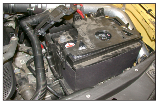
42. Reinstall the secondary battery cover as shown.