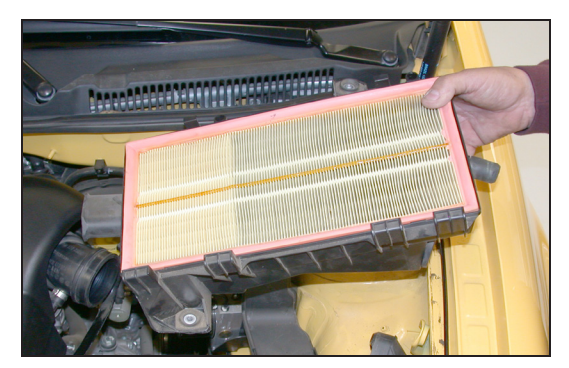
10. Remove the lower air cleaner assembly as shown.