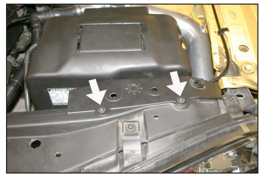
48. Reinstall the outer core support cover using the original screws as shown.