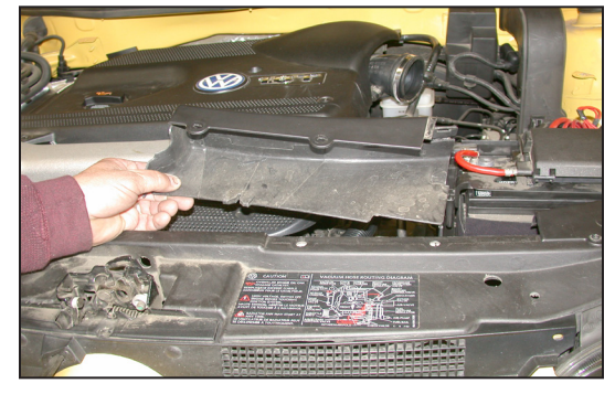
12. Remove the inner core support cover, which is secured by two screws.