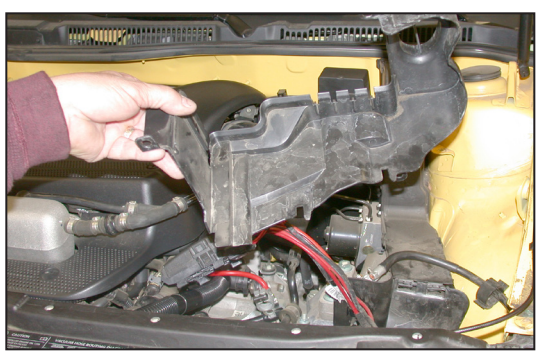
24. Remove the inner plastic headlight cover as shown.