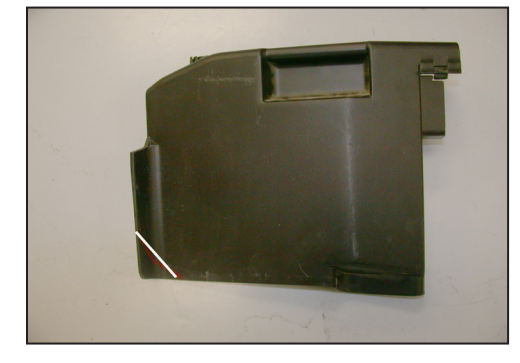
47. Trim the corner of the outer core support cover to provide clearance for the cold air tube as shown.