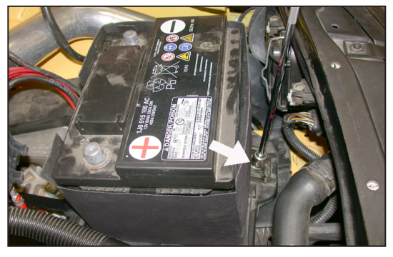
41. Reinstall the battery and the battery hold down block and secure as shown.