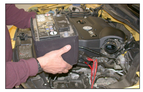
19. Remove the battery as shown.