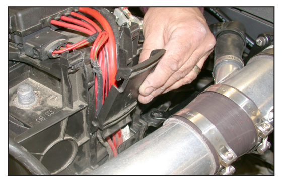
44. Slide the rear battery harness cover back onto the battery cover as shown.

43. Reverse the removal process and slide the battery fuse/harness onto the battery cover as shown.