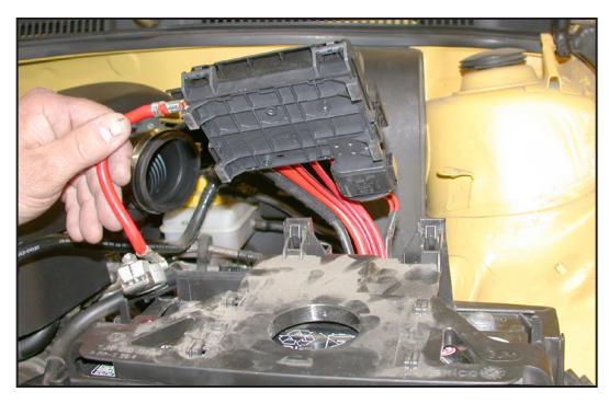
16. Slide the battery fuse/harness assembly backwards, then upwards as shown, and pull the battery fuse/harness assembly out of the way.