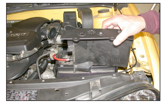
13. Remove the outer core support cover, which is secured by two screws.