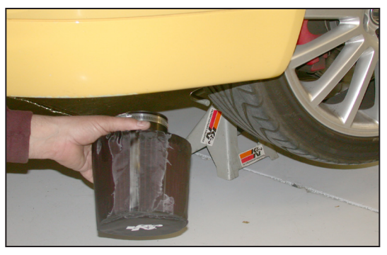
40. From underneath the vehicle install the filter onto the cold air tube and secure with the provided hose clamp.