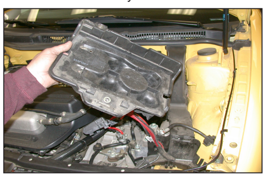
20. Remove the battery tray, which is secured by four bolts as shown.