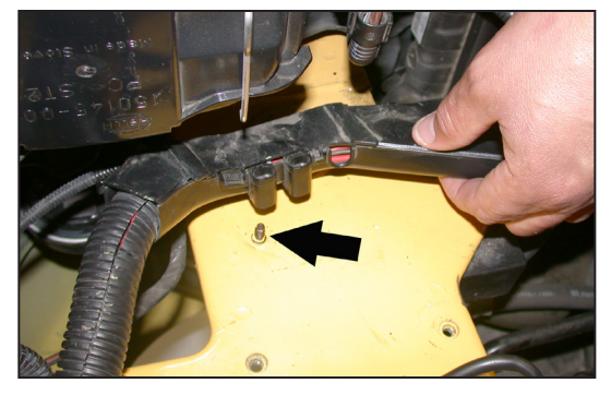
25. Remove the wire harness from the stud on the inner fender as shown.