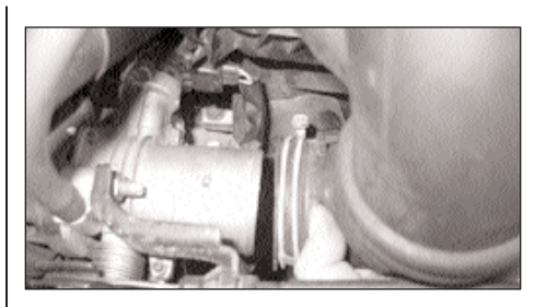
6. Unclip and remove the intake hose from the throttle body.