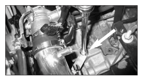
18. Secure the bracket to the threaded hole in the transmission housing using the M10 bolt and wave washer supplied.