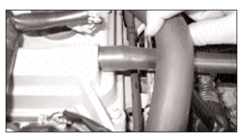
20. Fit the provided silicone breather hose to the breather tube on the valve cover.