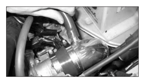
21 Fit the other end of the breather hose onto the intake tube.