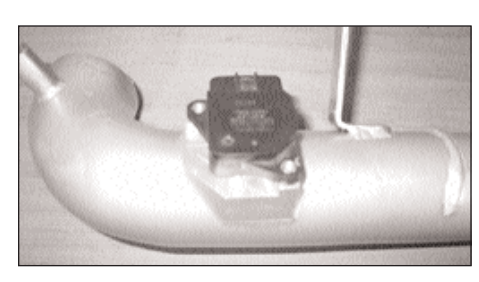
16. Carefully install the MAS into the intake tube using the two M4 Allen head bolts supplied.