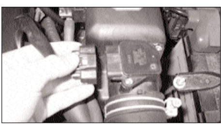
2. Unclip the electrical plug from the Mass Air Sensor (MAS).

1. Turn the ignition OFF and disconnect the vehicle's negative battery cable.