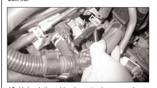
12. Unhook the wiring loom to give more clearance to the MAS connector lead.