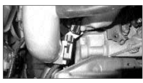
26. Reconnect the MAS electrical connector.