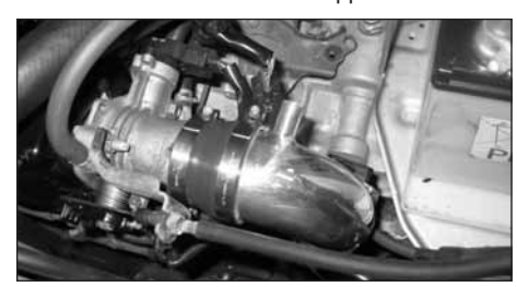
17. Fit the intake tube into the silicone hose using the hose clamp supplied. Do not fully tighten yet!