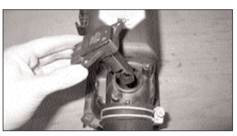
11. Carefully unbolt and remove the MAS from the air