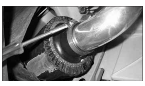
24. From underneath the car, slide the filter onto the intake tube & tighten the hose clamp.