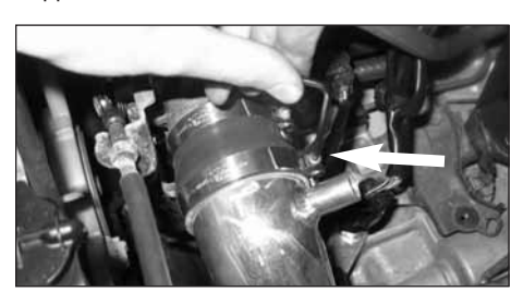
19. Tighten the hose clamp to secure the tube into the silicone hose.