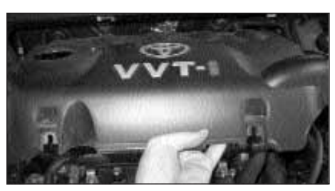
4. Undo the four bolts and remove the engine cover from the vehicle.