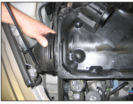
4. Disconnect the fresh air inlet duct from the air box as shown.