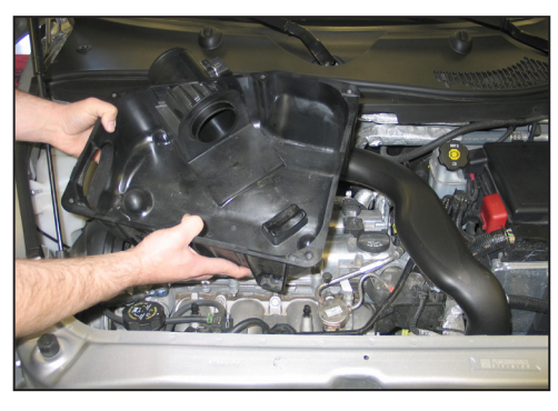
7. Remove the two clips securing the front of the air box to the engine and then remove the complete air box assembly from the vehicle.