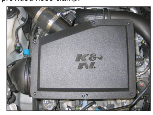
18. Install the K&N® air box lid and secure with the six factory screws.