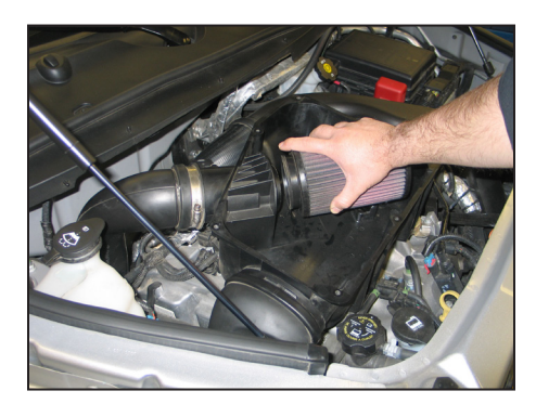
3. Remove the stock air filter from the air box as shown.

2. Remove the six TORX screws which secure the air box lid and then remove the air box lid from the vehicle.