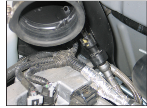
8. Release the crank case vent tube from the fitting on the stock intake tube.