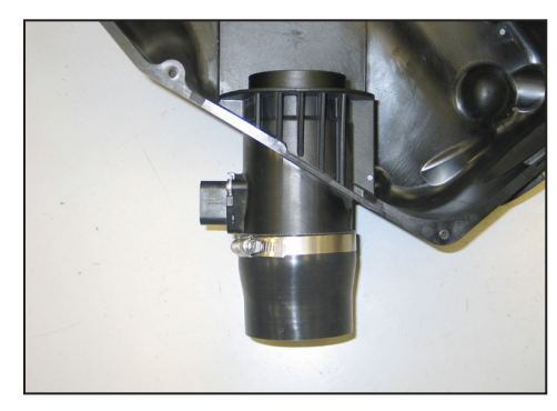
14. Install the provided silicone hose (08429) onto the factory air box and secure with the provided hose clamp.