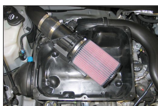
17. Install the K&N® air filter and secure with the provided hose clamp