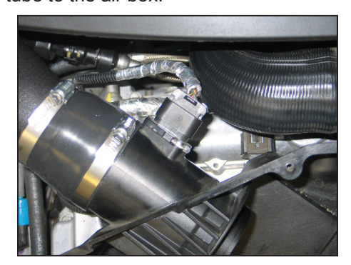
16. Reconnect the mass air sensor electrical connection.