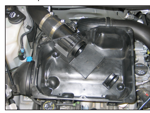
15. Install the air box onto the engine, connect the intake tube and secure with the provided hose clamp. Reinstall the retaining clips to secure the front of the air box. Reconnect the fresh air inlet tube to the air box.