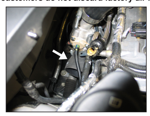
10. Install the provided silicone hose (08713) onto the turbo inlet and secure with the provided hose clamp.

NOTE: K&N Engineering, Inc., recommends that customers do not discard factory air intake.