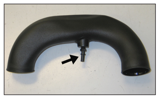
11. Install the provided crank case quick connect fitting into the K&N® intake tube as shown. NOTE: Plastic NPT fittings are easy to cross

thread. Install the vent fitting "hand" tight, then turn it two complete turns with a wrench.