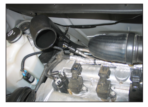
12. Install the K&N® intake tube into the silicone hose at the turbo inlet and secure with the provided hose clamp.

thread. Install the vent fitting "hand" tight, then turn it two complete turns with a wrench.