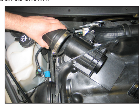
5. Loosen the hose clamp and then disconnect the stock intake tube from the air box.