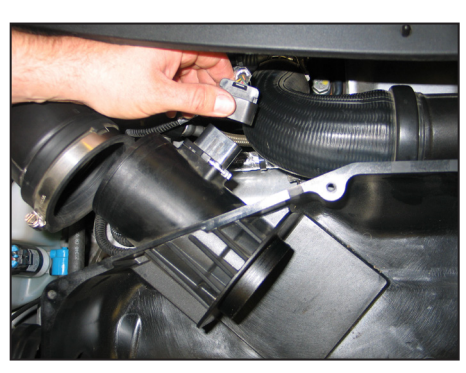
6. Disconnect the mass air sensor electrical connection.