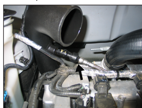
13. Connect the crank case vent hose to the quick connect fitting.