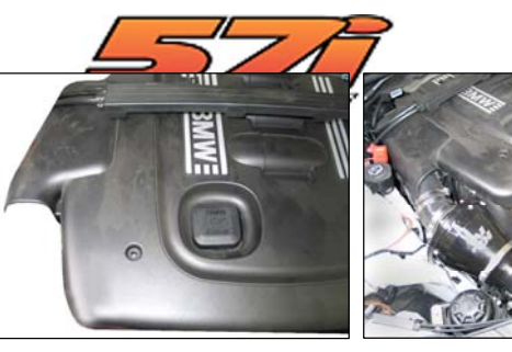
Fig. # 29 Fig. # 30 Fig. # 31 Fig. # 32