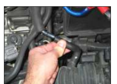
Fig. # 2