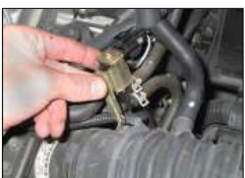
Fig. # 3