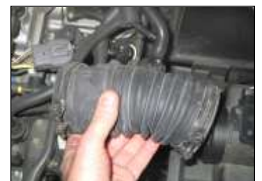
Fia. # 6