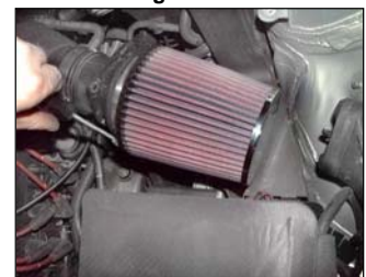
Fig. # 12