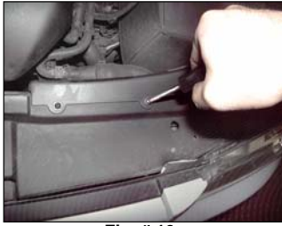
Fig. # 13