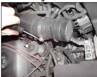
Fig. # 9