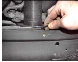
Fig. # 14