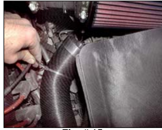
Fig. # 15