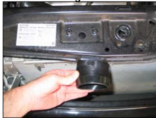
Fig. # 18