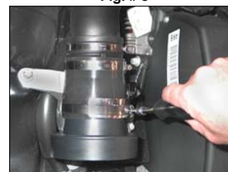
Fig. # 12