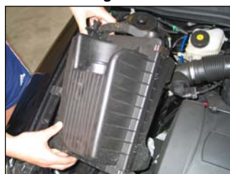
Fig. # 5