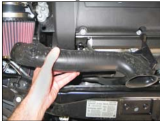
Fig. # 17