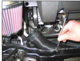
Fig. # 19