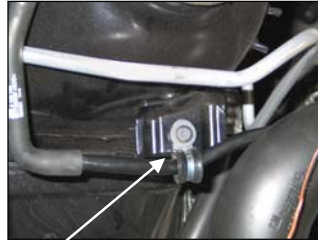
Fig. # 15