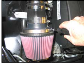
Fig. # 14