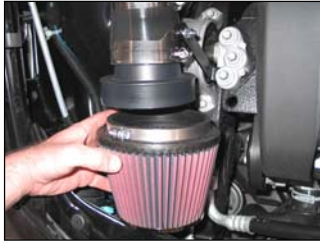
Fig. # 13