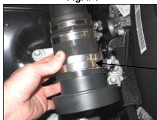
Fig. # 11