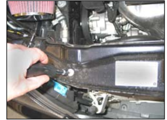
Fig. # 16