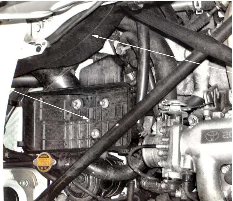
2. Remove the 3 bolts securing the air pick up box and remove from the car.

1. Remove the 3 bolts from inside the air box base and remove the air box base from the car.