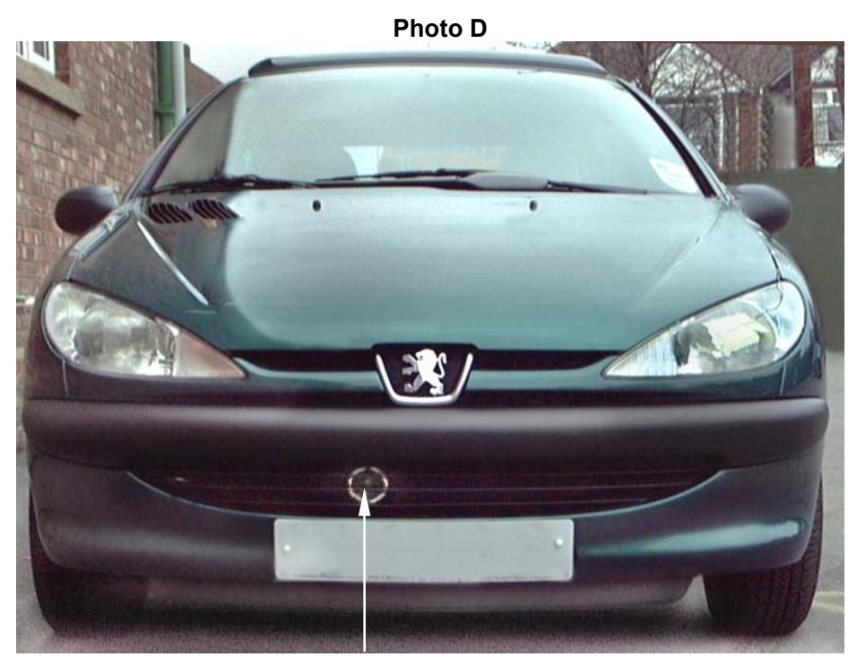
Pierce / drill a 3mm hole in the end of the flexi cold air hose, feed the hose down to the front lower grille and secure it to the grille using a plastic tie supplied.