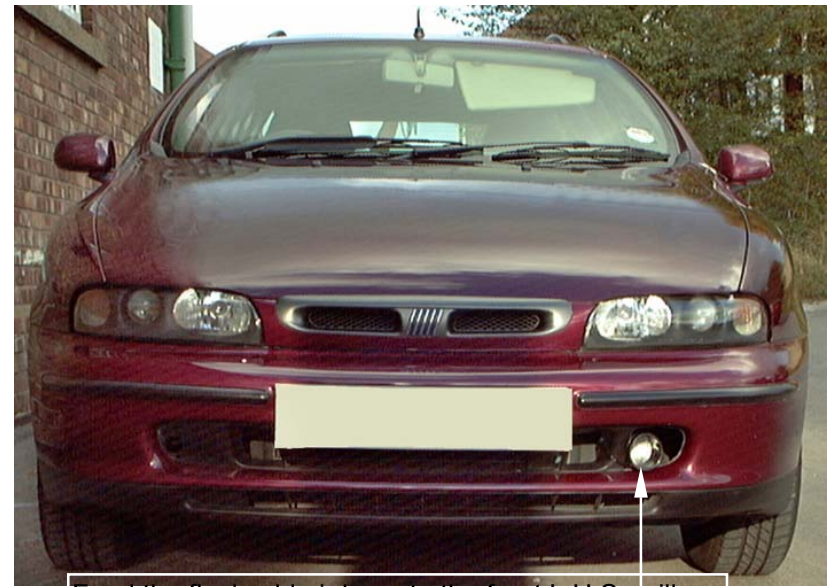
Feed the flexi cold air hose to the front L.H.S. grille and secure in place using a long plastic tie supplied.