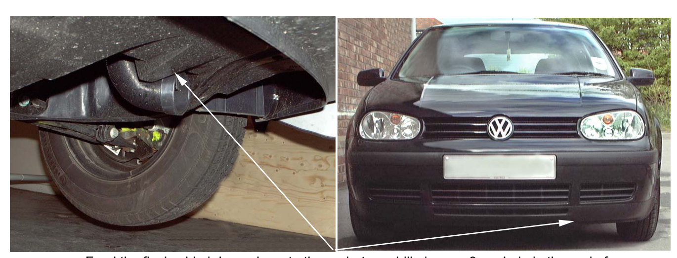
Feed the flexi cold air hose down to the undertray, drill pierce a 3mm hole in the end of the flexi cold air hose and undertray panel and secure with a long plastic tie supplied.