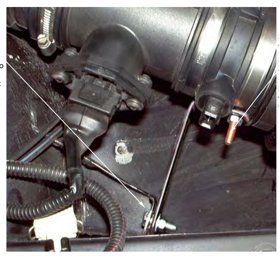
2. Fit the studded clip to the intake hose, do not tighten the clip yet. Attach the studded clip to the mounting bracket and secure with a nut and washers supplied.