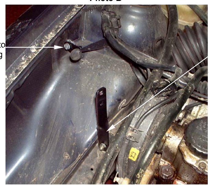
2. Attach the rubber bobbin and bracket to the rear air box mounting point using the nut and washers supplied.

1. Attach the angled bracket (with rubber pad) to the upper air box mounting point using the screw, nut and washers supplied.